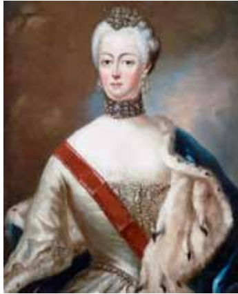
Catherine the Great (1729–1796) by Giovanni Battista Lampi (1751–1830).

The Russian monarchy feared that European Masonic orders were political Trojan horses that had been unwittingly welcomed into the country by naïve Russian Masons, who were oblivious to the Fraternity’s underlying political