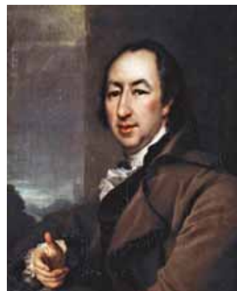
Nikolai Novikov, (1744–1818) by Dmitry Grigorievich Levitzky (1735–1822)

He states that Russian Masons should seek to expand their knowledge “without sending out missions to buy wisdom from abroad” and that they should shun the need for “foreign patronage in order to become wise.” In essence, he is acknowledging Catherine II’s criticism of Russian Freemasons as foreign lackeys, and advocating for a distinct and independent fraternity