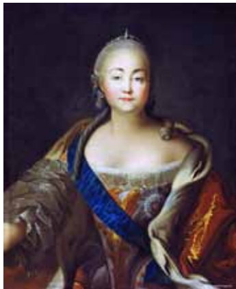
Empress Elizabeth (1709–1762) by Ivan Argunov (1729–1802).