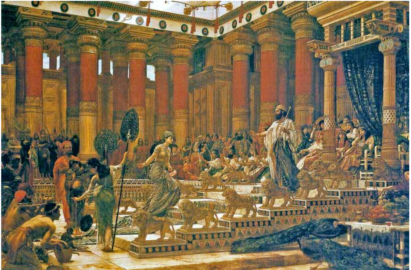
“The Visit of the Queen of Sheba to King Solomon,” oil on canvas, painting by Edward Poynter, 1890, closely follows the descriptions from the Bible. It is now at the Art Gallery of New South Wales, Australia.

could rarely travel more than 20 miles per day. Arabian camels were tall and hardy, able to store water and fat for three weeks while living only on desert roughage.